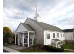
Saint Anthony of Padua Church 26 Hammond St. Mattapoisett, MA