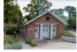
Saint Rita of Cascia Church 121 Front St. Marion, MA