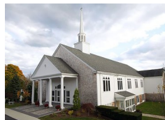
Saint Anthony of Padua Church 26 Hammond St. Mattapoisett, MA