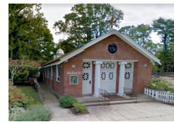
Saint Rita of Cascia Church 121 Front St. Marion, MA